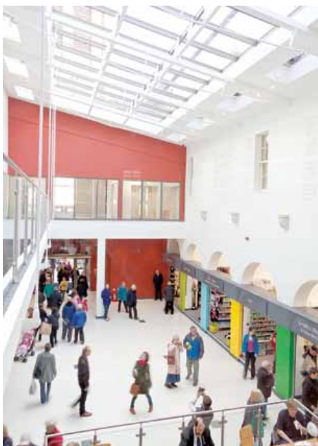
Market Hall interior

See page 23 for details or visit www.chesterfieldvenuehire.co.uk