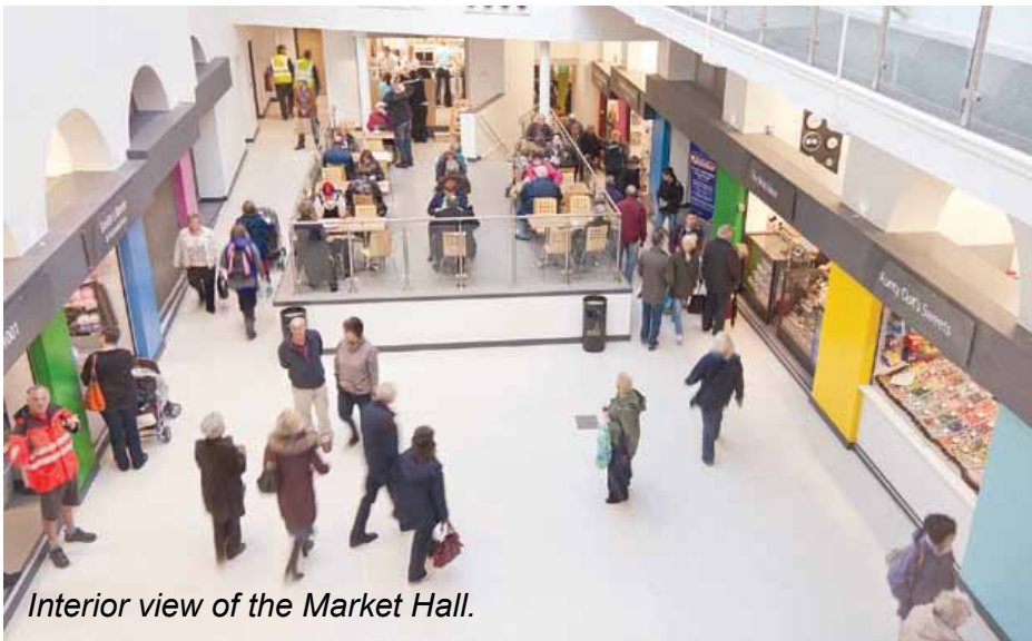
Interior view of the Market Hall.

If you are interested in a new retail unit, contact Claire Cunningham on 01246 345255.