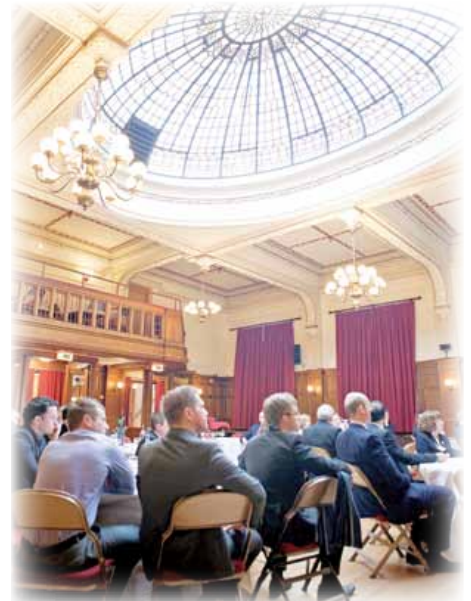
Winding Wheel ballroom showing the beautiful ornamental skylight

It was renamed the Pomegranate Theatre in 1982 in a public competition. The pomegranate is a symbol on the borough's coat of arms and can be seen represented in the auditorium.