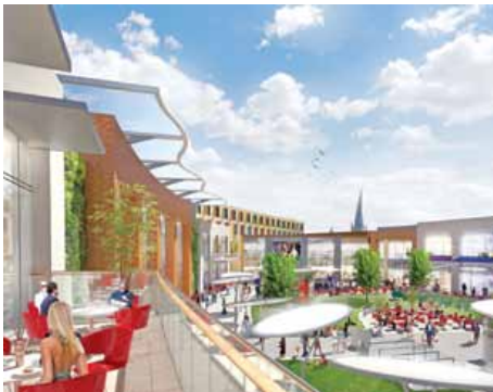
Artist impression of the inner open air section of the Northern Gateway development