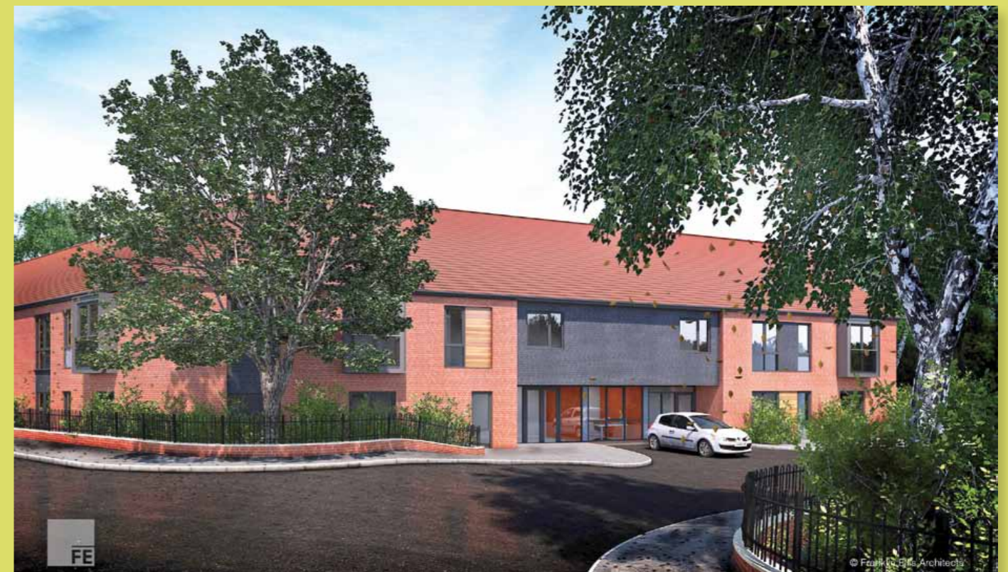
Parkside older persons’ housing scheme

“We could stand outside and watch the fireworks in the park and there was always plenty of food, hot dogs, burgers, curry, you name it – it will be nice to be able to do that again.”