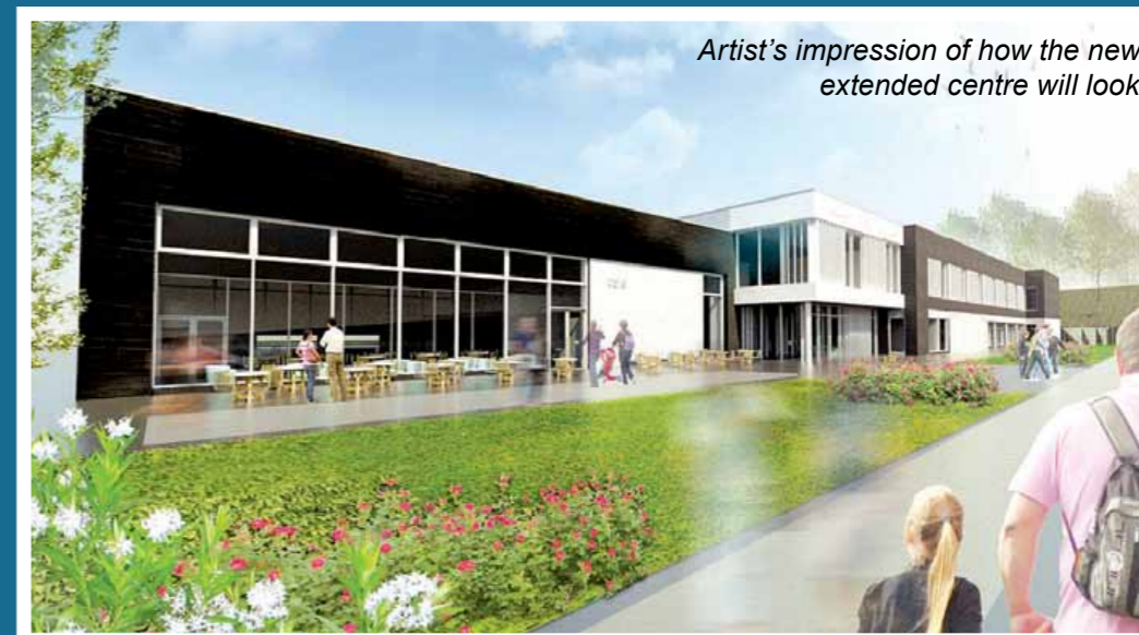
Artist's impression of how the new, extended centre will look.

The current Queen's Park Sports Centre will remain open until the new centre opens in early 2016.