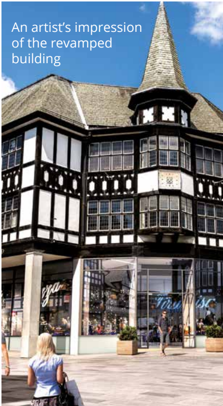
An artist's impression of the revamped building