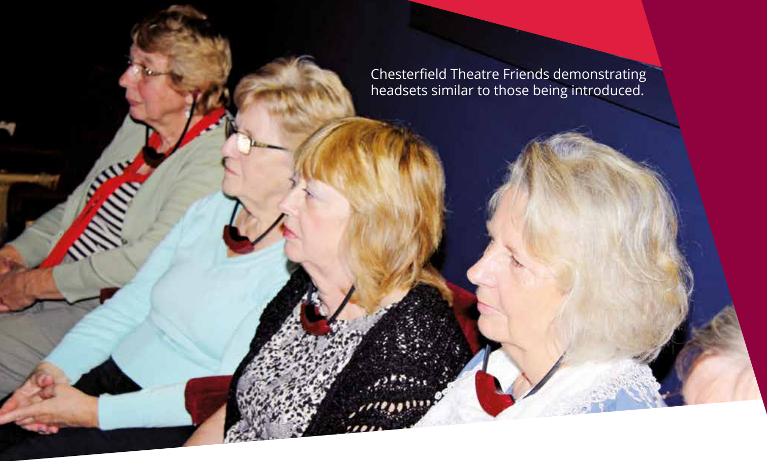
Chesterfield Theatre Friends demonstrating headsets similar to those being introduced.

The theatre already has headsets for its infra-red hearing system.