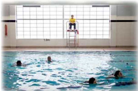
Swim at both leisure centres