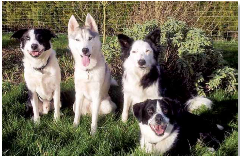
Spirit is shown second from the left with her new friends.

A full list of charges is on our website. Visit www.chesterfield.gov.uk and click on the Lost Dogs