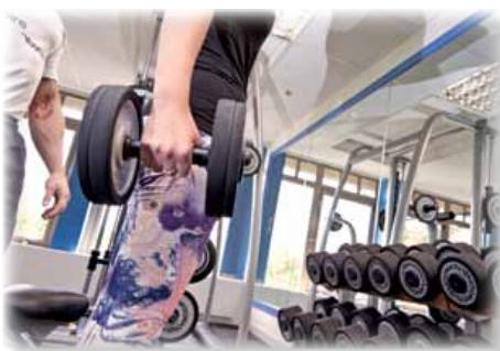
Gym at both leisure centres