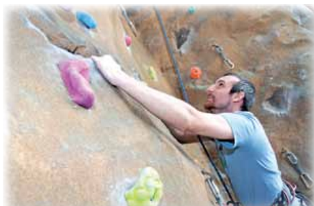
The climbing wall at the Healthy Living Centre