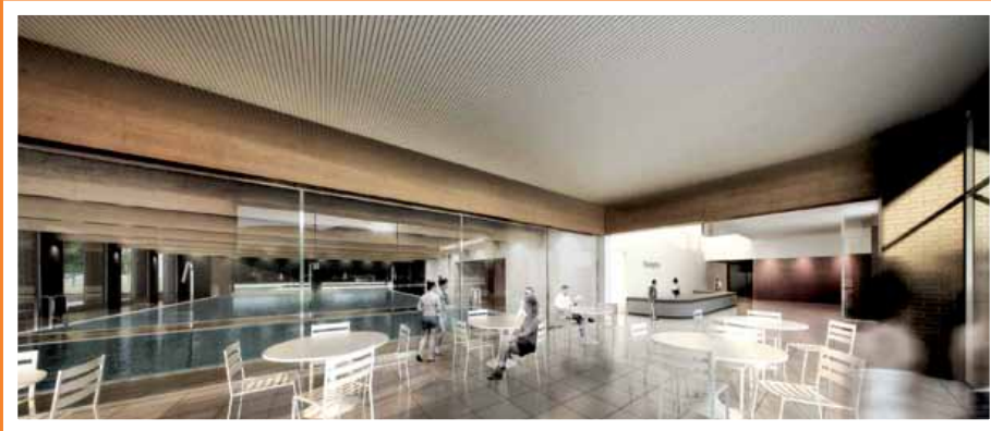
Artist impression of the café looking onto the pool (subject to change)

A funding bid has been made to significantly improve the facilities on offer at the new Queen's Park Sports Centre.