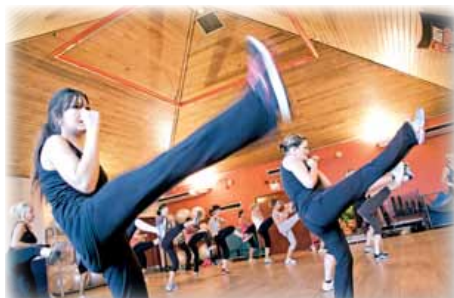
Group exercise classes at both leisure centres