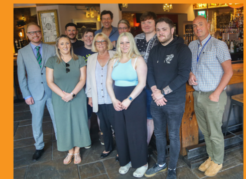
Representatives from across the town centre who have signed to the Best Bar None scheme.

The new digital radio network is just one initiative which is benefiting from funding through the UKSPF, after the council was successful in securing £2.6m from the Government fund.